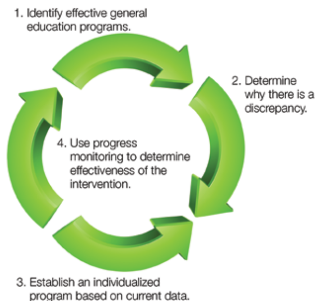
Figure 1. Problem-Solving Model

Students considered most at risk (Tiers II and III) are progress monitored frequently to determine the effectiveness of the chosen intervention. Even though this monitoring is frequent, it is designed so that it is not time intensive for the classroom teacher. The process allows educators to assess quickly and make appropriate academic decisions for students (Fuchs 2003; Griffiths et al. 2006). Because progress monitoring occurs on a regular basis, there is no waiting until the next major assessment to determine whether an intervention worked. If it is determined during progress monitoring that the current intervention is not effective, then the intervention can be altered or completely revised.